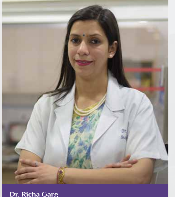
M.B.B.S., D.C.P. (Surgical Pathologist & Cytologist)